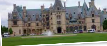
THE HOUSE THAT VANDERBILT BUILT: The stately and opulent Biltmore House.

Biltmore House is America's largest private home – a